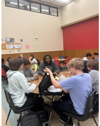
Stop the Violence Phase 2: Panel Discussion & Community Circles